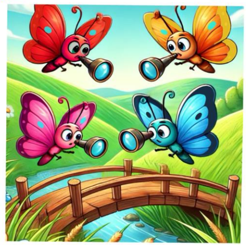
The Lost Cloud